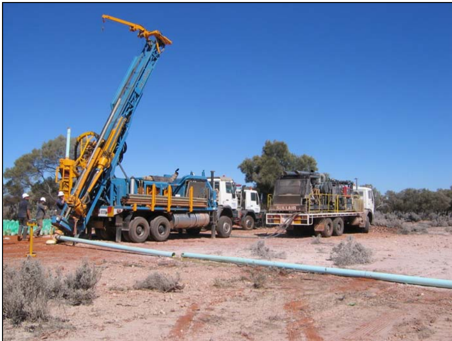
Challenge Drilling RC Drill Rig in action November 2007